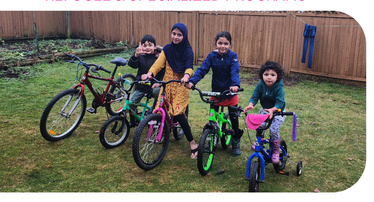
A partnership with Our Community Bikes allowed us to give 60 bikes to refugee families.