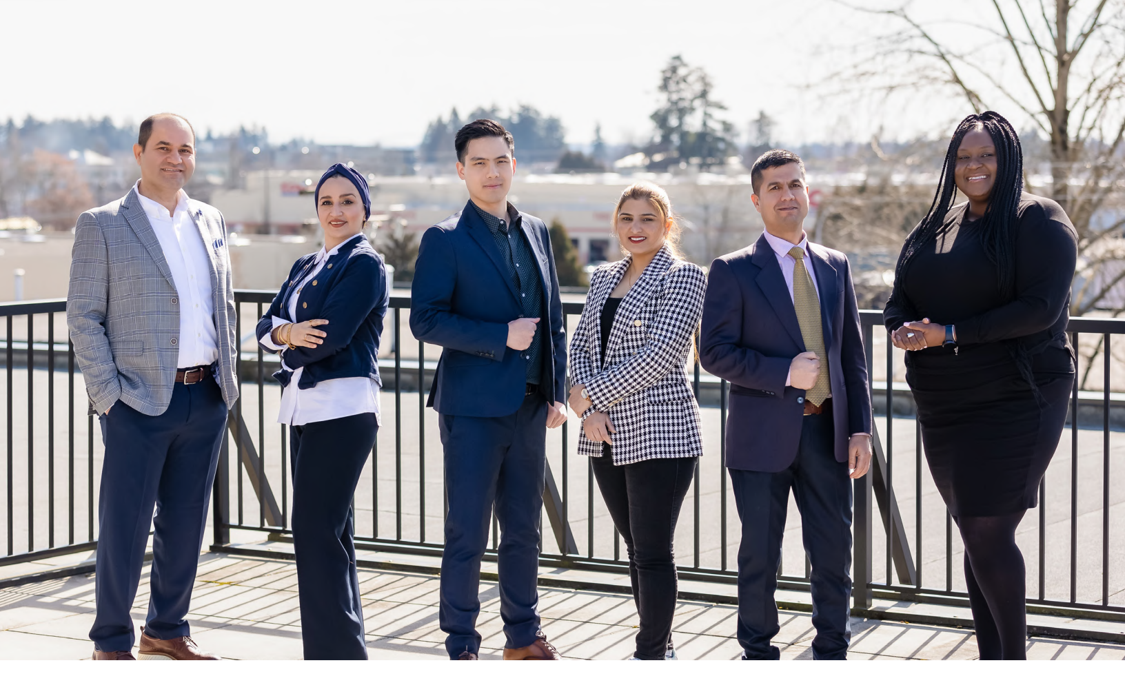
DIVERSEcity team members are the strength behind our impact in the community.