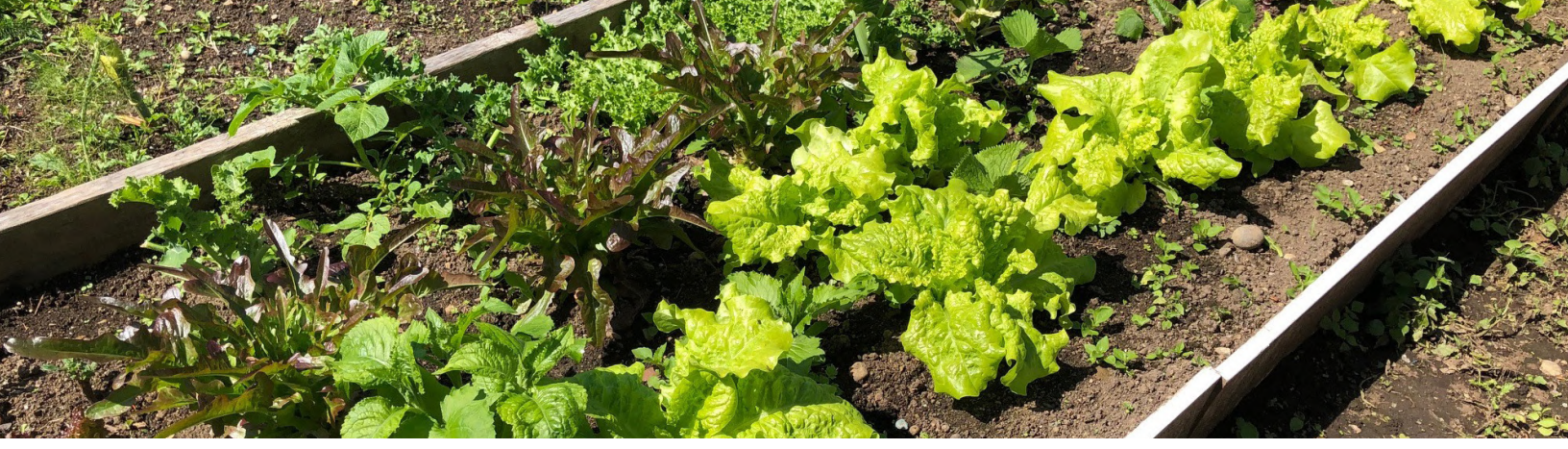
Our gardens are flourishing with vegetables thanks to the hard work of our garden participants!