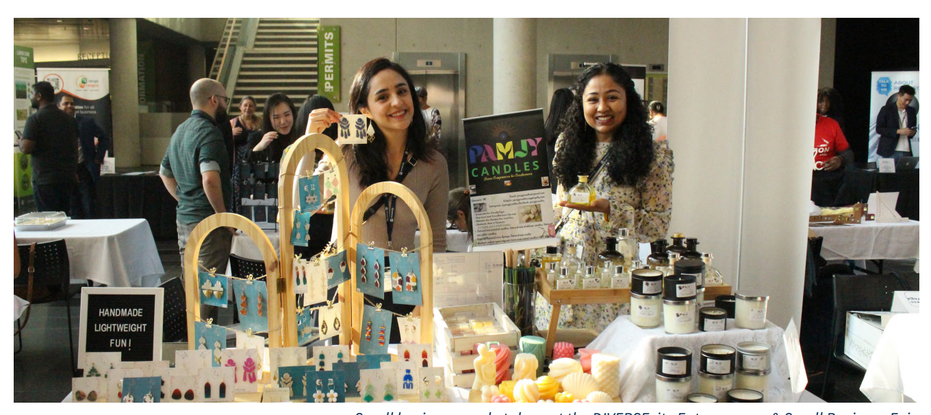
Small business marketplace at the DIVERSEcity Entrepreneur & Small Business Fair.