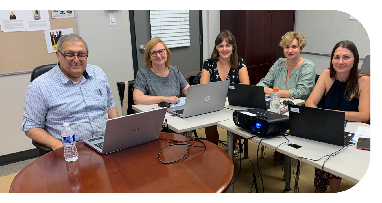
Ukrainian newcomers upgrade their computer skills with DIVERSEcity Skills Training Centre in their first language!