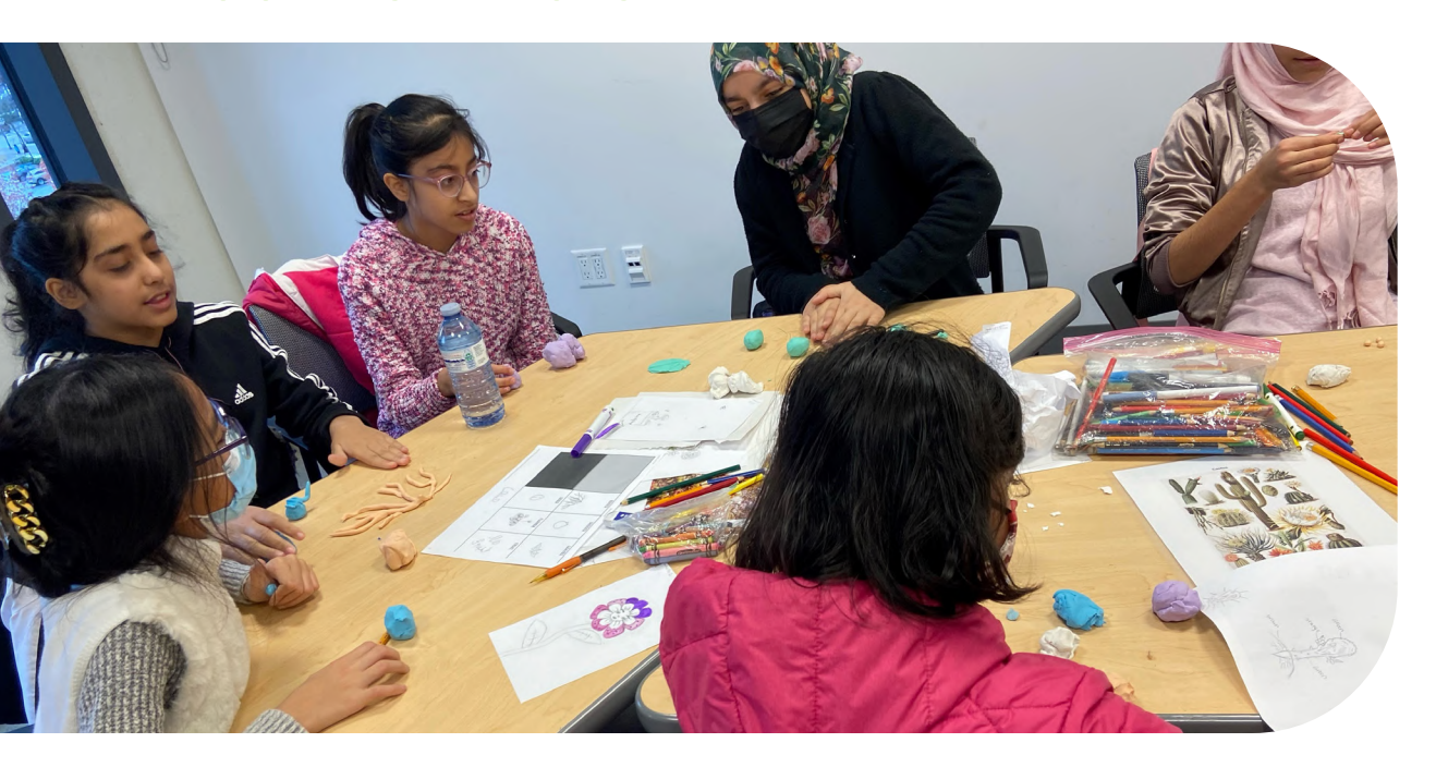
Power Girls power through their STEM projects at Simon Fraser University!