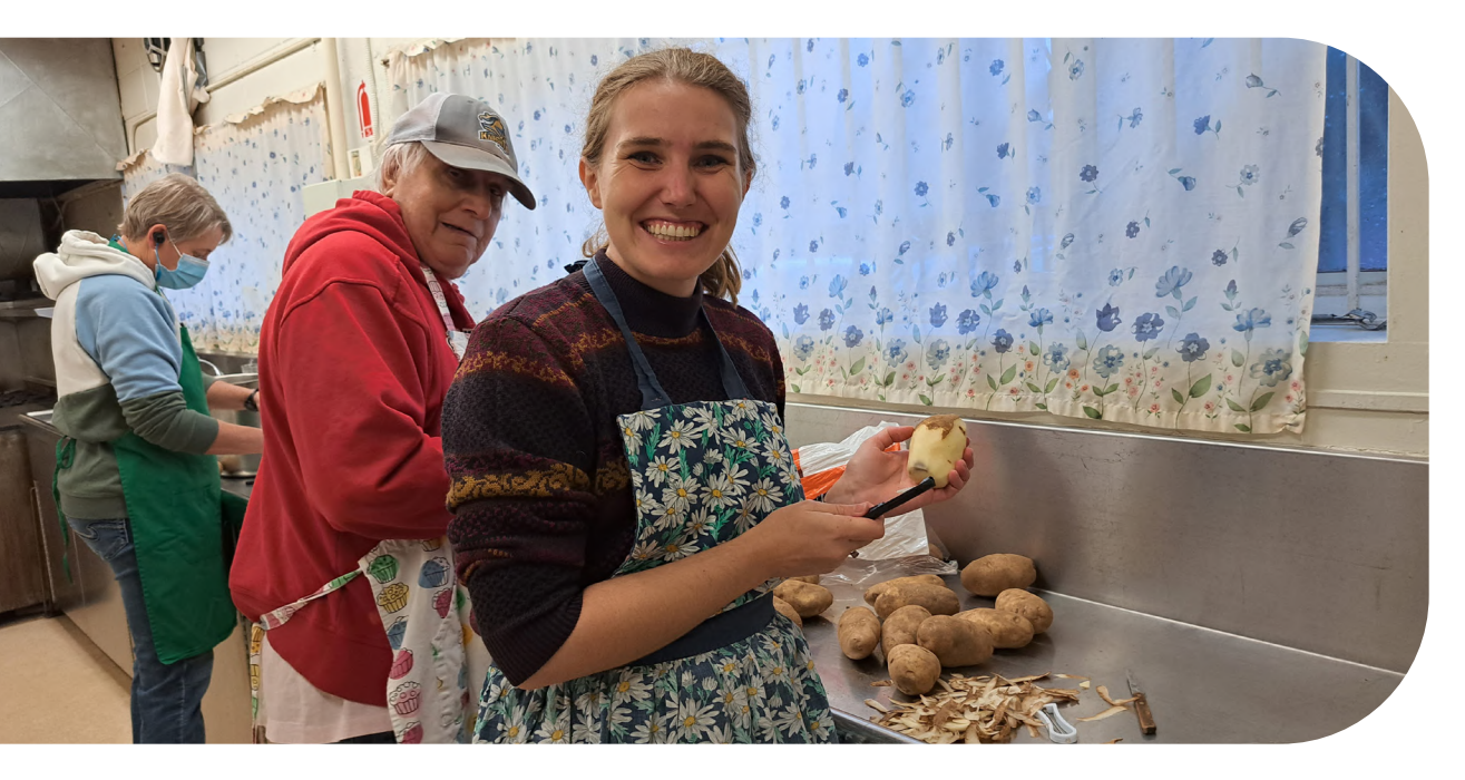
The South Fraser Refugee Readiness Team made 1,500 perogies with Ukrainian newcomers at one of many events this year!