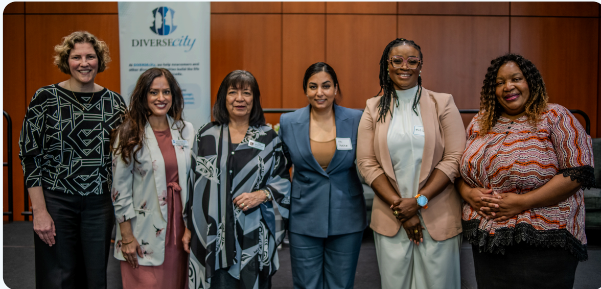
Top: DIVERSEtalks Panel

The 2024 event was a sold-out success with 250+ attendees, including CEOs, business professionals, dignitaries, emerging leaders and women from all walks of life, connecting together to inspire and learn from one another!