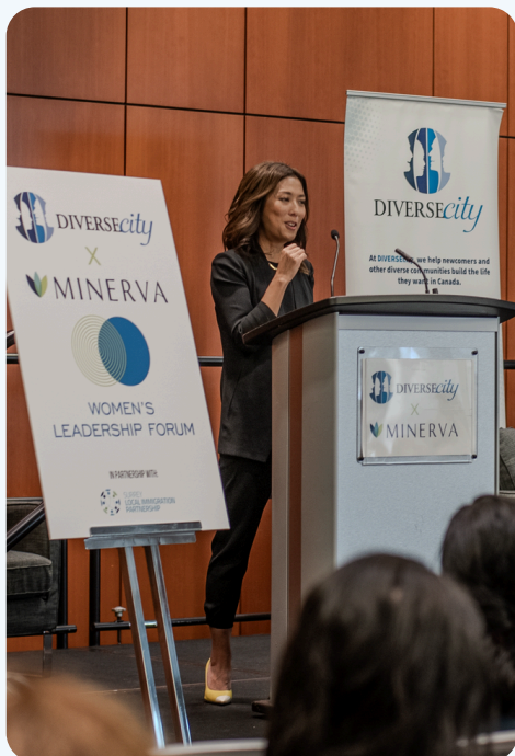
Left: Keynote Speaker